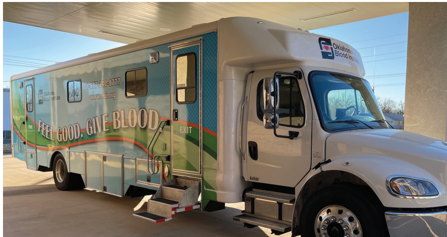
The mobile unit from the Oklahoma Blood Institute offers safe, easy access for donors.